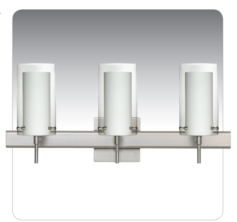
PAHU 4 SHOWN IN CLEAR/OPAL (C44007) WITH SQUARE CANOPY

UL or ETL Listed. Suitable for Damp Locations (interior use only).